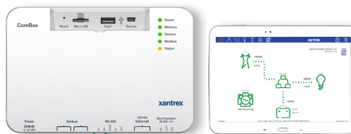
FREEDOM SW Conext Combox (809-0918)

Available telephone to network cable adapter to avoid the need to replace cables when replacing and old inverter. (#808-9010 sold separately)