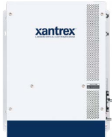
FREEDOM SW (817-1000, 817-2000, 817-2000-21, 817-3000)