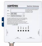
XANTREX GATEWAY (808-1888)