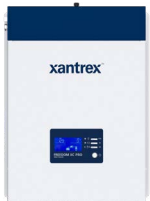
FREEDOM XC Pro (818-2010, 818-3010)