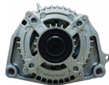
XANTREX ALTERNATORS Contact Sales